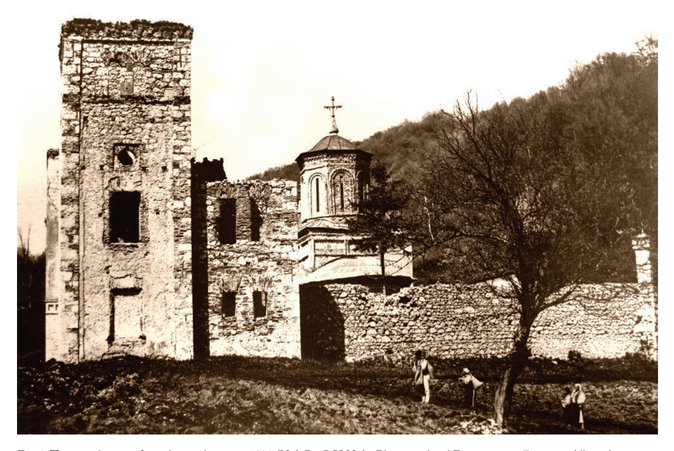
Fig. 8. The complex seen from the south-east in 1930.

of the church, where there are twelve separate apartments, formerly intended for the internment of those convicted of political offences in particular, is in quite good condition, but the quarters of the service personnel cannot be moved here because this part of the building was constructed as a prison, with small windows up by the ceiling. The other wing of the building with two storeys, in which the monks were meant to live, is everywhere in disrepair, and the ceilings and even the floors of the upper storey have caved in and in places the beams have rotted. Finally, the belfry, likewise in disrepair, has been damaged by the rain."75 The two members who visited the monument – writer Ioan Slavici and architect G. Mandrea – demanded that repairs be made to the monument, which had been founded by Matei Basarab, the prince "who created the most national epoch in our history."76 Their recommendations do not exclude the continued use of the buildings for the function that had been established for them by Barbu Știrbei in the mid-nineteenth century: "Arnota being situated in a most isolated spot, it would in the opinion of the commission be a very suitable penitentiary for the high clergy and other well-off people convicted for deeds that cannot be classed as common crimes, particularly for people more unfortunate than they are morally corrupt, whom society must shield from contact with genuine evil-doers."77