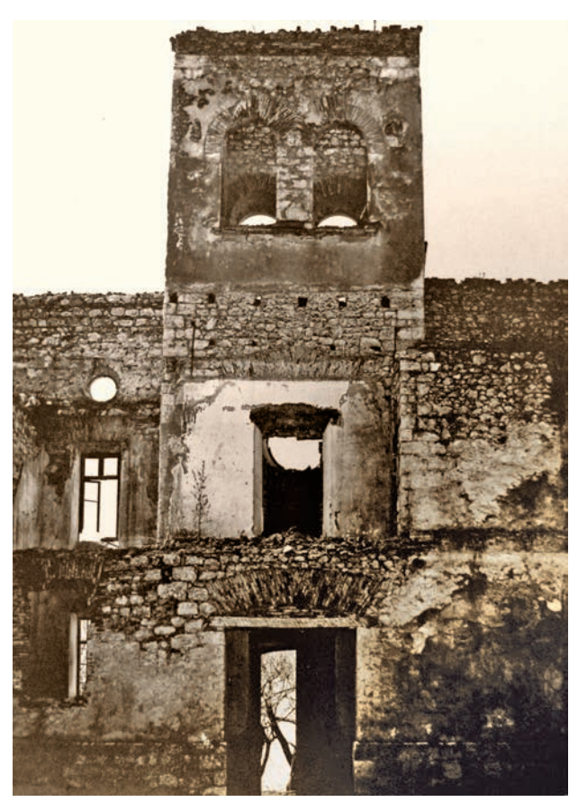
Figs. 6-7. Arnota Monastery: the west wing in 1930 / the belfry seen from the monastery court in 1930 (N.A.R.-C.H.N.A., Photographical Documents collection – Albums).

sent to Arnota for "political crimes" transformed the monastery gaol, which had never been used, into a significant place, one that, according to contemporary accounts, "... came to be the country's and the populace's greatest fear."<sup>71</sup> "The name Arnota remained proverbial and even long afterwards the saying 'to Arnota with him!' could still be heard."<sup>72</sup> Those directly involved in ruling the country and their critics made a decisive contribution to the prison's renown as a place of imprisonment for those who opposed the ruling prince. In political commentaries in the press of the time there were frequent references to the "... magnificent prison at Arnota, built with the State's money, whose cells and cellars were ready for whoever ventured to appeal to justice or to speak to the Rumanians about rights, about their country's autonomy."<sup>73</sup> Of the abuses of the "regulation boyar class" it was said: "... crimes among which the least warrants no less than the imprisonment of the perpetrator for life in that magnificent citadel at Arnota [...] intended by Prince Știrbei for political criminals, as he defined them, which is to say, for those who ventured during his reign to speak out against arbitrary rule, against tyranny and above all against the benevolent protection of the Tsar."<sup>74</sup>