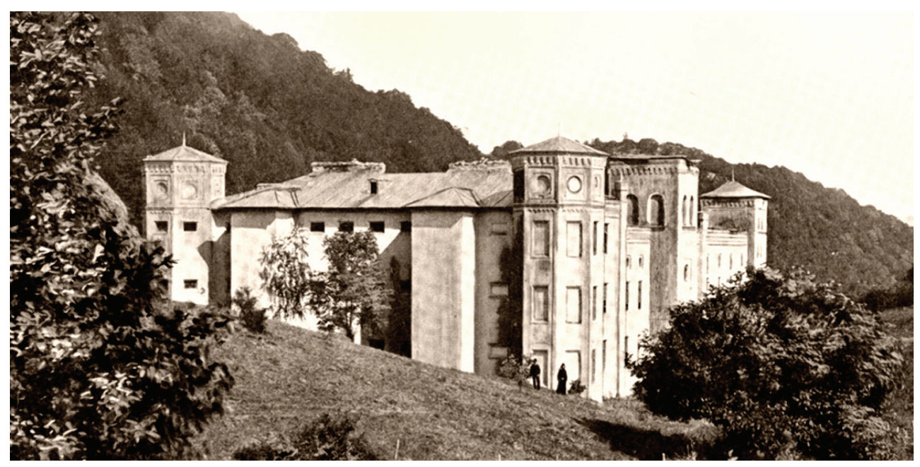
Fig. 4. Arnota Monastery, view from south-east at the end of the 19th century (Antoniu, 1901).