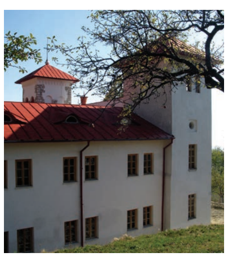
Figs. 9-10. Arnota Monastery: the south wing after the recent alterations (H. Moldovan 2009) / North-eastern view after the recent alterations (H. Moldovan 2012).