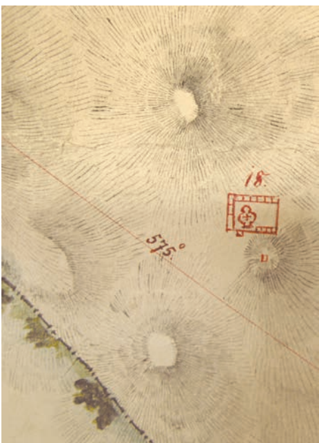
Figs. 2-3. G. Pleşoianu (land-surveyor), "Plan of the main domain of Arnota Monastery", 1838 (N.A.R.-C.H.N.A., Plans collection, Vilcea County, no. 42).