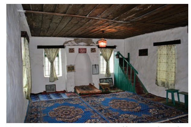
Figs. 1a-b. Mosque in Bărăganu village (Constanța County).

Meanwhile the places of worship deteriorate: the minaret of the mosque did not exist any longer at the date of my visit, while both Orthodox churches displayed cracks and alterations in various places.