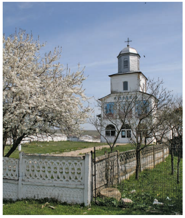
Fig. 2a-b. Orthodox church in Ceamurlia de Jos village (Constanța County).