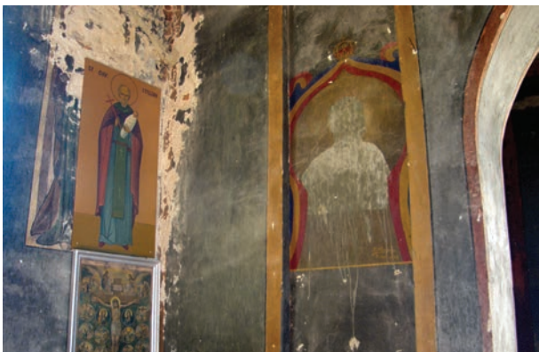
Fig. 3. Orthodox church in Mireasa village (Constanța County).