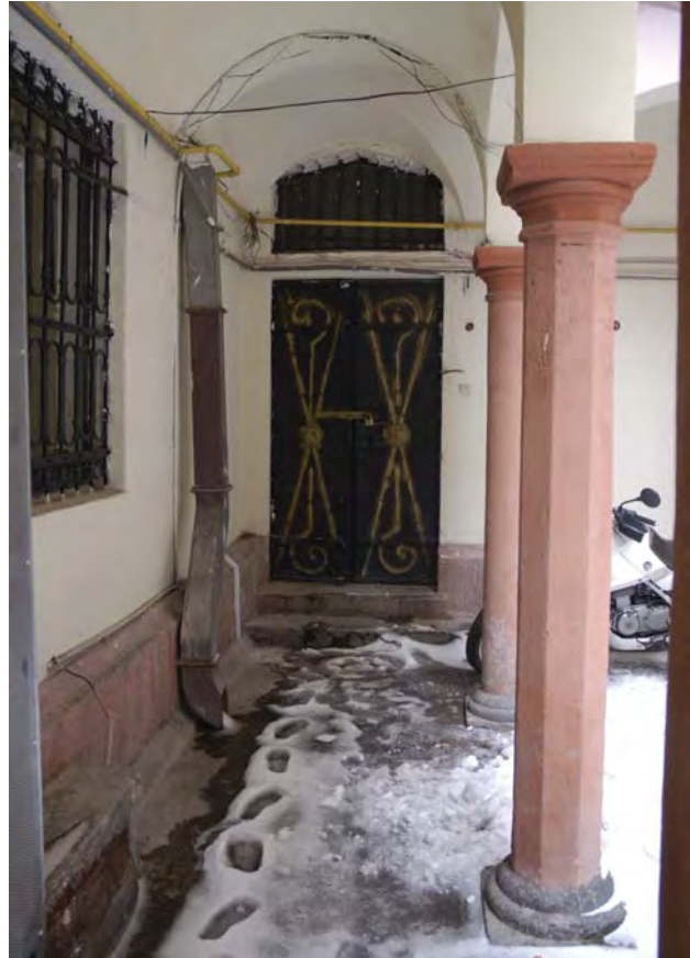
Fig. 7 Stone columns which had belong to the old inn.

stone columns and the shutters of the old inn were preserved and integrated into the new complex. “Thus only the stone columns and the shutters remained intact in the courtyard of the new building.” 20 In the middle of the courtyard there was a rectangular pool which had four carved frogs in the corners (Figs. 6-8).