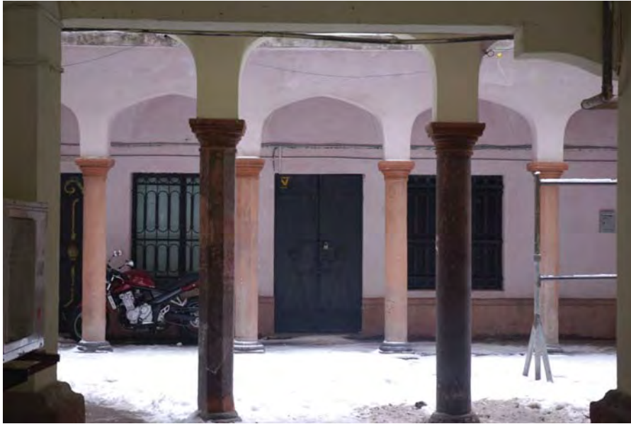
Fig. 8 Plot no. 14-16 from Blănari street. The inner court.

the name of the hotel. The plan of the Geographic Institute of the Army, drawn up between 1895 and 1899 (Fig. 5), is relevant for the regularization of the course of Blănari Street officially established a decade earlier. On the land where the hotel had been until recently located, now owned by Mr. Alexandru Simionescu,