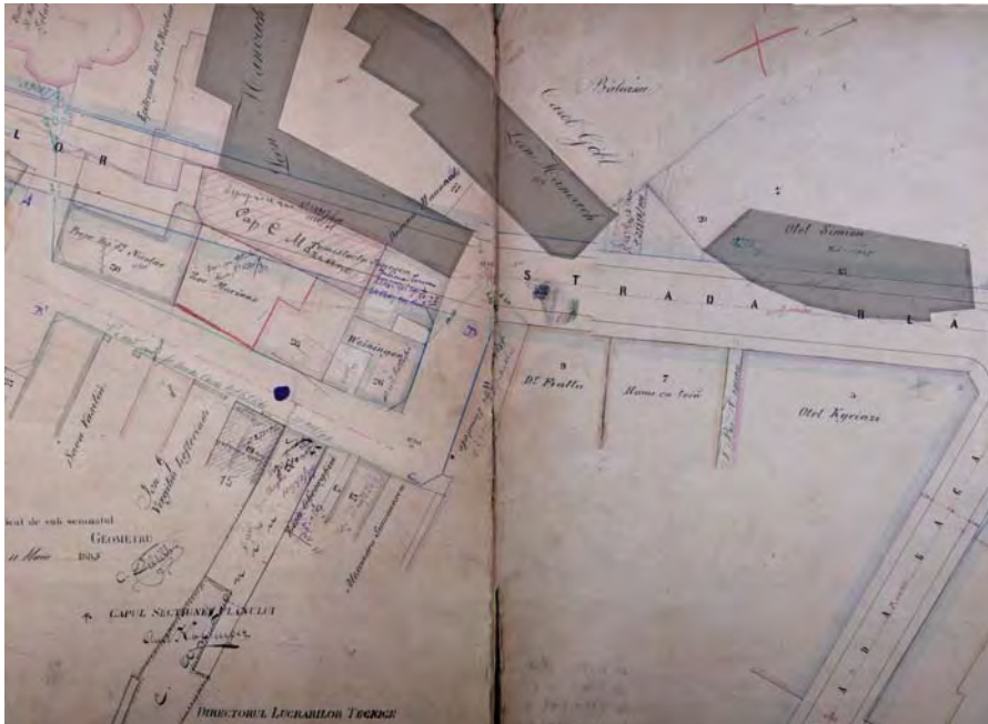
Fig. 3 Ion Românu Inn and Simion's Inn. (N.A. – B.M.D., B.M.P. Fund, Alignment Service, File no. 52/1885).

Ionescu - Gion states that it is “located in the area where the back side of Simion hotel used to be until last year”, 9 Colonel Popescu-Lumină 10 asserts that it was situated on Blănari Street, while Ion Ionașcu suggests the intersection of I.C. Brătianu Boulevard and Blănari Street 11 , in front of Băcani Street, information which is however corrected by Nicolae Stoicescu, who, based on Major Pappasoglu's plan of 1871, 12 added that it was “near Colțea Inn, in the proximity of St. Gheorghe Nou church”. 13 A cartographic source which drastically restricts the area of study is the plan prepared by R.A. Borroczy in 1852