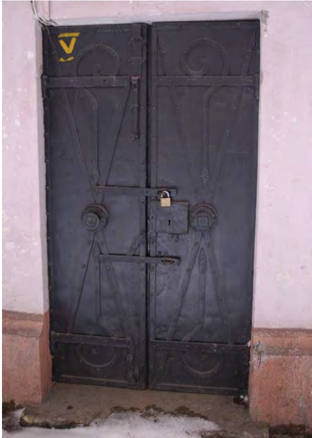
Fig. 6 The original shutters of the inn.