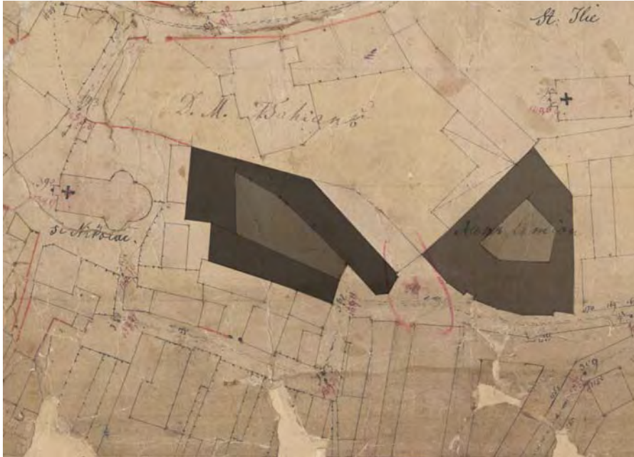
Fig. 4. Ion Românuł Inn and Simion's Inn. (Borroczyń plan made between 1844 and 1846).

premises. The access point, which was controlled by a metal gate, was on Blănari Street. The buildings facing North and West were endowed with porticos with circular and hexagonal stone columns that supported a number of flat arches. The empty areas of the ground floor of the South and West buildings were provided with