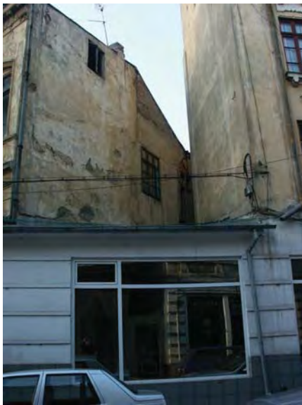
Fig. 9 Dead wall disposed towards near plot.

the name of the hotel. The plan of the Geographic Institute of the Army, drawn up between 1895 and 1899 (Fig. 5), is relevant for the regularization of the course of Blănari Street officially established a decade earlier. On the land where the hotel had been until recently located, now owned by Mr. Alexandru Simionescu,