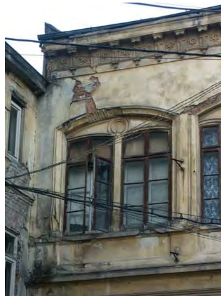
Fig. 10 Possibility used the old bricks.

there is only one building whose footprint coincides with part of the West side of the former inn. The part facing Blănari Street was demolished and the façade was rebuilt retreated a few meters, according to the city administration decision. Most likely the volume that can be seen now (Figs. 9-11) from Blănari Street was built during that period, using bricks from the former structure, the shape and size of the bricks confirming such a hypothesis. The restoration of the construction at the end of the nineteenth century can be supported by the presence on the East side of the building of a fire wall which practically would have matched the façade facing the patio, a layout which is atypical for an inn. The survey of the ground floor completed in April 2002 25 shows a functional layout