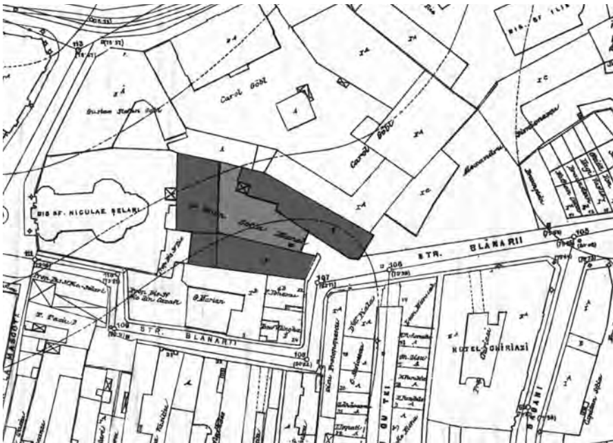
Fig. 5 Ion Românuł Inn. (Plan made by Geographical Institute of the Army between 1895-1899).

premises. The access point, which was controlled by a metal gate, was on Blănari Street. The buildings facing North and West were endowed with porticos with circular and hexagonal stone columns that supported a number of flat arches. The empty areas of the ground floor of the South and West buildings were provided with