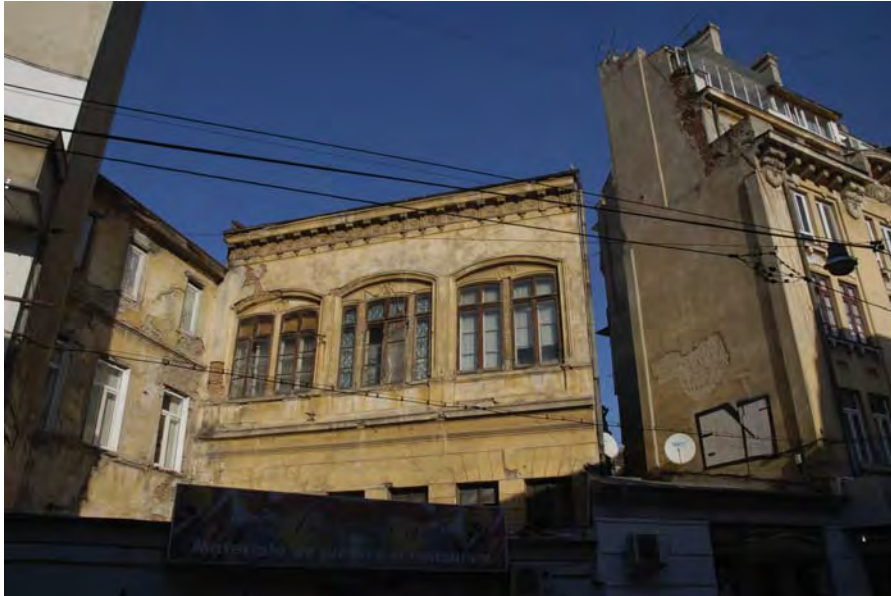
Fig. 11 Part of building which some researchers considers that belongs to Simion's Inn.

identify the plots of land where they were located and even traces of their existence. This leads to the elimination of a number of controversies regarding the position of these complexes often cited by those who focused on the city history.