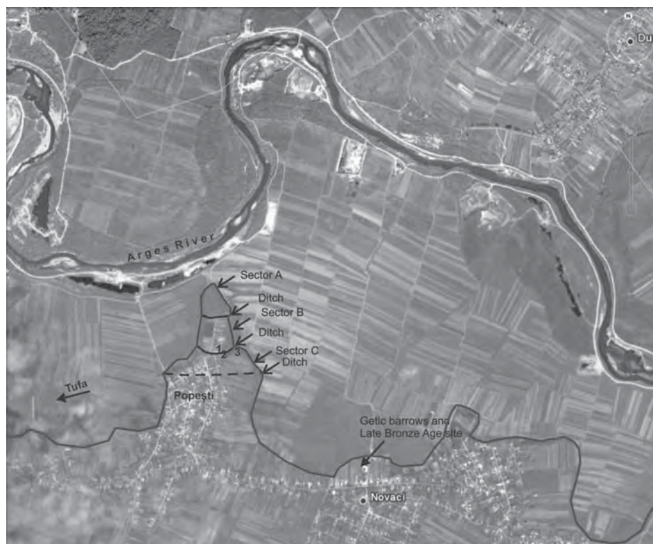
Fig. 3. Popești (Co. Giurgiu). The archaeological site and the church seen from the west.