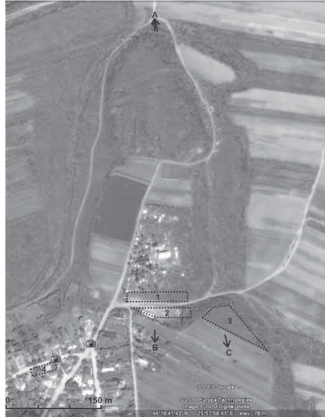
Fig. 5. Popești (Co. Giurgiu). 1–4: the four locations suggested for the museum; A–C: axes of the profiles in Fig. 6.