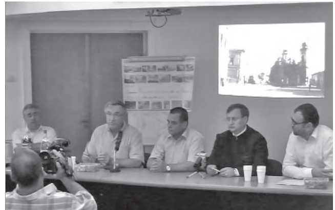
Fig. 8. Press conference held at The Argeș County Museum, July 13, 2007.