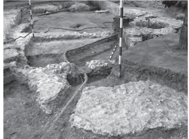
Fig. 4. The foundations of the altar and nave of the churches from 1812 and from the mid eighteenth century, unveiled during the excavations of June-July 2007. View from the west.