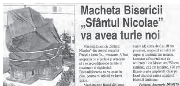
Fig. 14. News release, “Argeșul” newspaper, year CXXXII, October 8, 2009, p. 5.