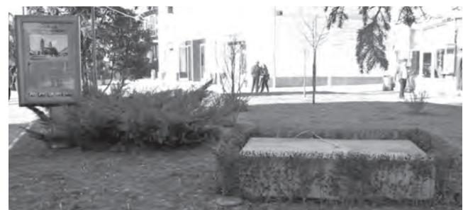
Fig. 15. Empty base, nearby the explanatory panel (April 2011).