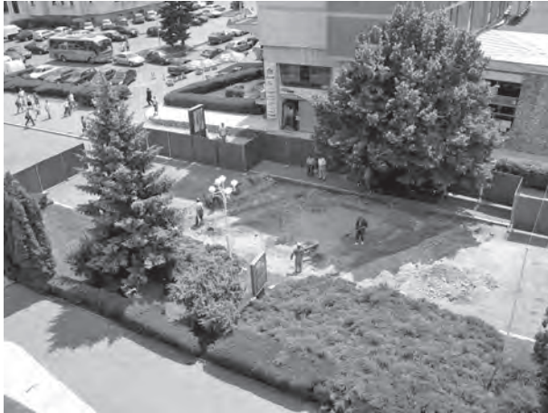
Fig. 3. Discovery of the nave foundations built in 1812.