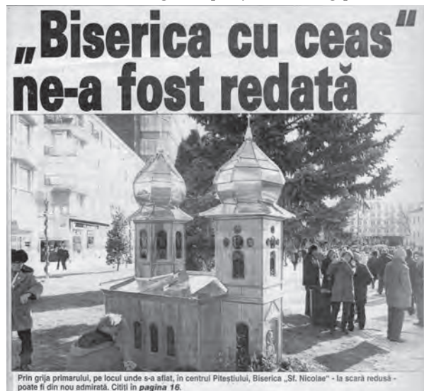
Fig. 13. Press report, “Argeșul” newspaper, year CXXXI, no. 5497, December 29, 2008, p. 1.