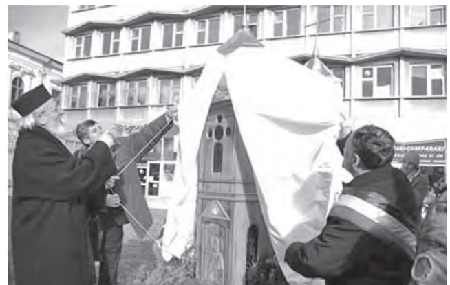
Fig. 10. Unveiling ceremony of a miniature church, December 26, 2008. According to www.centrul-cultural-Pitești.ro .

in as such by the construction company to the City Council (the beneficiary of the works). Soon a decision should be taken in relation to the possibility of in situ preservation for the church remains (a first for Pitești), an option which – as the local press articles began showing – the City Council tended to make, and to which city residents expressed their enthusiasm and full agreement.