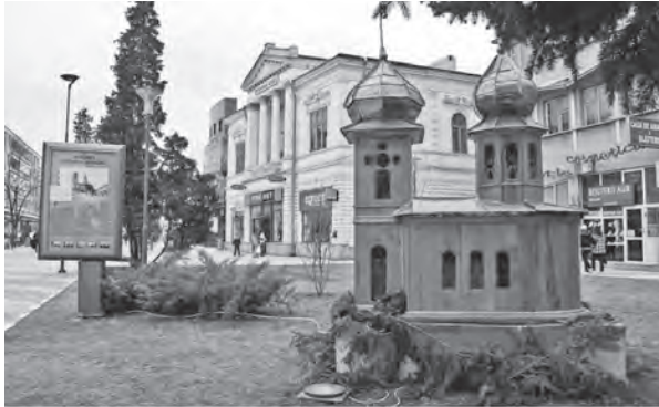
Fig. 11. Miniature church and explanatory panel. Photo by Alex Șerban. According to http://syvantone.blogspot.com .