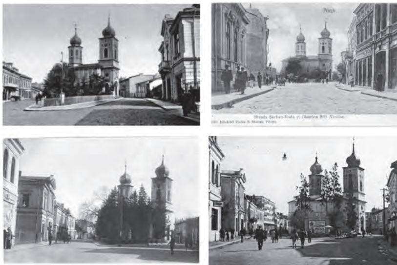
Fig. 1. St Nicholas and St Panteleimon Church, Piteşti. Different views on old picture postcards and photos, ca. 1900-1961.

The latest campaign to modernize the city center had three successive stages (completed in 2000, 2003 and 2008) and targeted the entire central axis with a length of 800 m, represented by the pedestrian area between “Vasile Milea” Square (end south-east) and “Alexandru Davila” Theatre (north-west). Atypical and unexpected for Piteşti, this massive modernization action led to the rediscovery and restoration of one of the most important symbols and landmarks of its identity: St Nicholas and St Panteleimon Church (known as “The Town Clock Church”), gone missing about half a century ago, also a victim of the actions of modernization and systematization.