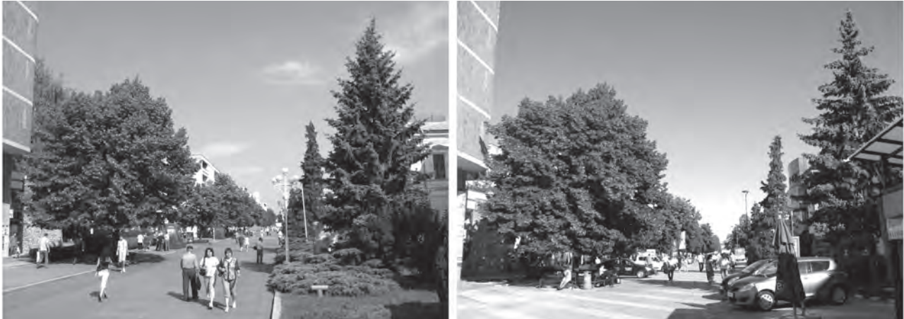
Fig. 16. Pedestrian area under which are the remains of "The Town Clock Church", immediately before the start of archaeological excavations – June 2007 (1) and at present – June 2011 (2).

media, unanimously fallen in ecstasy: The Town Clock Church has been given again to us (Fig. 13) and The Town Clock Church brought back into Pitești life ("Argeșul", 29 December 2008), St. Nicholas Church was rebuilt in the city center ("Curierul Zilei", 29 December 2008) etc.