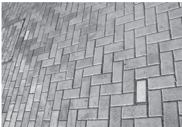
Fig. 9. Spot lights embedded in the actual pavement, on the track of the nave walls of the church from 1812.