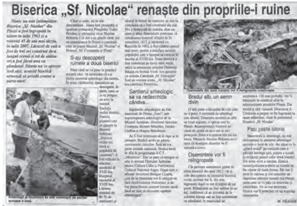
Fig. 7. Press report, “Argeșul” newspaper, year CXXX, no. 5055, June 14-15, 2007, p. 16.