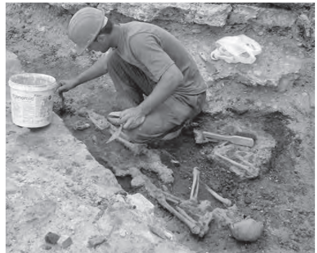
Fig. 6. Research of a grave outside the southern nave wall of the church from 1812.