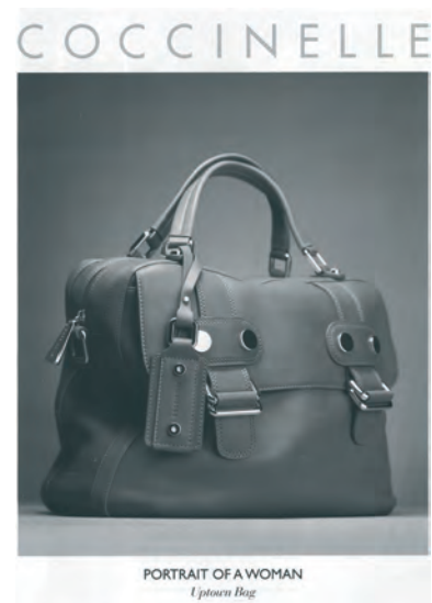
Fig. 1. Advertisement in the German edition of the French magazine Elle , October 2008, p. 317: “Portrait of a woman. Uptown Bag”.

In July 2008, in the Romanian edition of the well known American journal National Geographic an article signed by the deputy editor in chief was published, dedicated to the archaeological excavations at Pietrele. 12 Based on the information provided by the archaeologists, the journalist builds around the Copper Age people at Gorgana a copycat image of the present. On the first page of the article, the project director from the German side invokes the rich graves at Varna, as a reflection of the emergence of social differences,