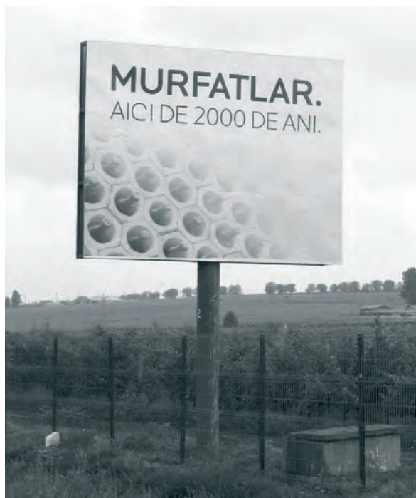
Fig. 4. Advertisement for the “Murfatlar” wines: “Murfatlar. Here for 2000 years”.

“I want to prove that archaeology can make money. I have already tried here at Popina-Bordușani an experiment. We organized a sort of open gates day. [...] We will go further because my dream is to recreate that paradise of 7000 years ago fully, to declare the entire area protected, the whole ecosystem as well, to build Gumelnița and Getic houses, and beside them, Romanian and Lipova traditional houses. I want to prove the great endurance of that civilization, especially the fact that the endurance is owed to the symbiosis with the environment and respect for the environment. We have here a treasure, and I dare to say, even a national one, as things have remained unchanged for many millennia. It could become a place of cultural tourism, a source of wealth for local people and, why not,